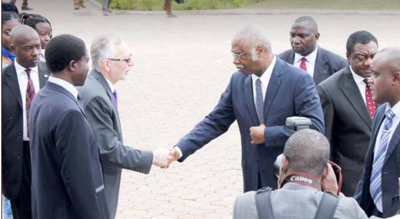
The Prime Minister of Cameroon (Philemon Yang) Welcomed by Church Leaders