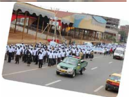
Parade at boulevard du 20 Mai in Yaounde