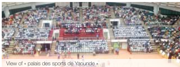
View of « palais des sports de Yaounde »