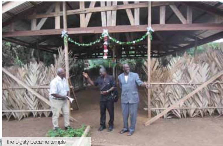
the pigsty became temple