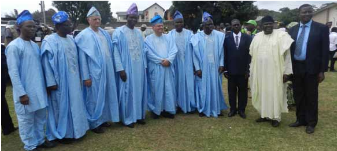
A Cross Section of Field Presidents who worked and supported the Growth